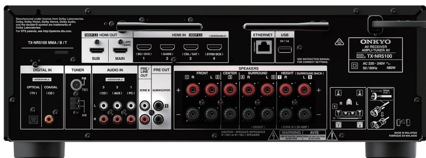
Text on receiver may vary with region.