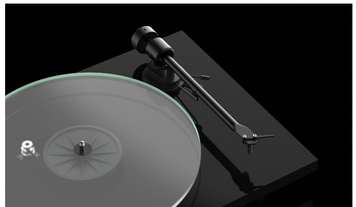
One-piece aluminium tonearm Robust and stiff construction for pure sound fidelity

Alongside the chosen motor system, the T1 is therefore able to ensure a smooth, anti-resonant rotational platform for the tonearm and cartridge to ride across.