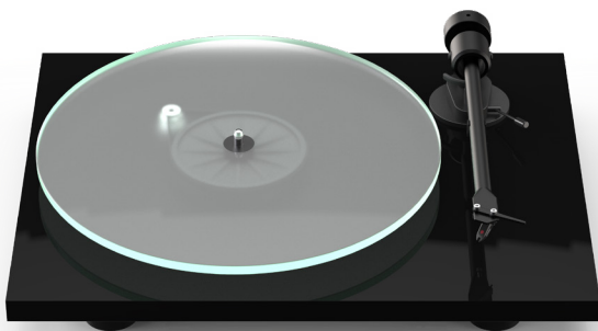
Superb build-quality, stylish looks and audiophile sound Precision CNC'd plinth and heavy zero-resonance glass platter

The stylish CNC-machined plinth, available in High Gloss Black, Satin White or Walnut finish, features no plastic parts and is carefully manufactured to ensure there are no hollow spaces inside, therefore avoiding unwanted vibrations within the chassis.