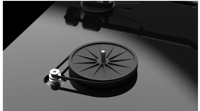
Ultra-precise motor and sub-platter design Lowest noise with immaculate speed stability

In the T1, the motor drives a belt-system, attached to a newly designed sub-platter, which is mounted into an ultra-precise 0.001mm main bearing with a hardened steel axle and brass bushing – just like our coveted Essential III turntables.