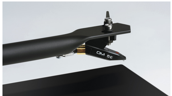
High-quality Ortofon OM 5E Moving Magnet cartridge with elliptical stylus tip

The T1 is a new affordable marvel. Still made in Europe by a turntable factory with decades of experience, it is a true hi-fi turntable that looks and sounds sublime.