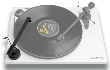
Type 3 Outside motor with or without speed switch button

If there is enough space, the upper left corner is an ideal place for the record broom.