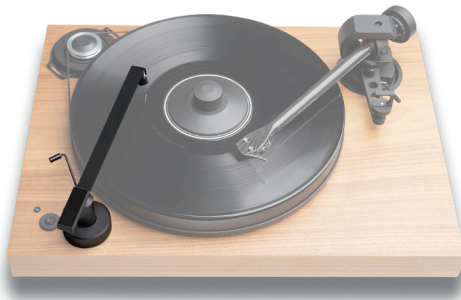
Type 2 Outside motor with speed switch button