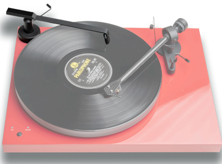
Type 1 Motor under platter

The record broom can be placed in one of two left hand side corners of the turntable. The placement is depending on the type and shape of your turntable. At the optimal position the brush should align with the spindle (i.e. the center of the platter). Deviations (relative to the spindle) between 1,5 to 2 cm are well compensated by design of the Sweep it S2. Higher deviations can cause more drastic skating effects.