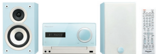
X-CM32BT-L (Light Blue)