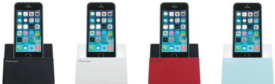
iPod/iPhone/iPad stand (same colour as the main unit) included