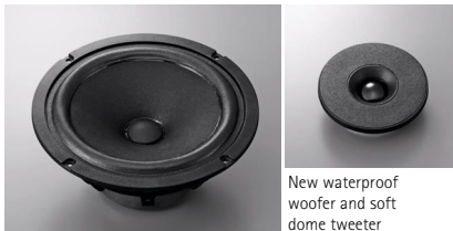
New waterproof woofer and soft dome tweeter

Yamaha drew on its long experience as a manufacturer of top quality HiFi speaker systems to develop these three all-weather models. We were able to make them extremely durable while still maintaining audio performance up to Yamaha standards. The woofer uses a highly responsive cone and a fluid-cooled soft dome tweeter, both specially processed for water resistance. The internal structure has been carefully designed for optimal time alignment between the two units, providing proper sound imaging. A waveguide and front baffle ensure good sound dispersion characteristics. Tonal clarity in all frequency ranges is excellent, with very low distortion.