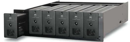
Six CI 720 mounted in RM720 rack (optional accessory)

The 60-watt per channel, single-zone CI 720 V2 Network Stereo Zone Amplifier with HybridDigital™ amplification technology is the perfect addition to today's most advanced custom home audio systems. Featuring 60 watts per channel, and powered by BluOS™, the advanced music management operating system, the CI 720 V2 allows you to access and stream 24-bit high-res music with the control of a smartphone or tablet via Ethernet and third-party control systems like Control4, Crestron, RTI and URC. The CI 720 V2 is now more flexible than ever with AirPlay 2 built-in for easy integration into the Apple ecosystem.